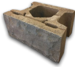
Smooth Standard 203 x 457 x 305 mm 8 x 18 x 12 in