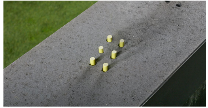
Keystone Linear works as a stand-alone step or with a Keystone Linear wall.