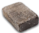
Standard 102 x 305 x 203 mm 4 x 12 x 8 in